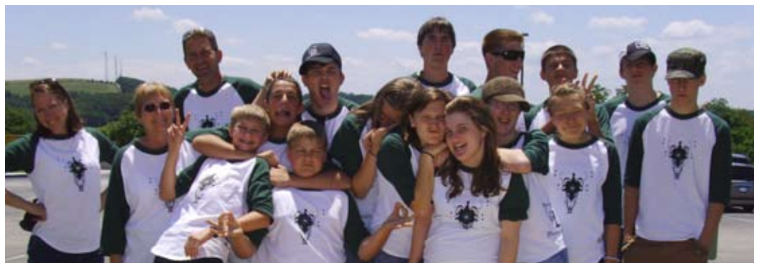
Our youth group went to Pennsylvania in July for their mission trip to help those in need.