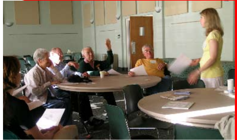
A diverse collection of activities are available at UUM-C-u on Wednesdays. Above, attendees gather last spring for a session on health. Join us on Wednesdays starting with dinner at 5:30.

Along with each of these programs, much more is available at UUM-C-u on Wednesdays. Other activities include meditation & prayer, bell & chancel choir practice, and activities for kids and youth and childcare.