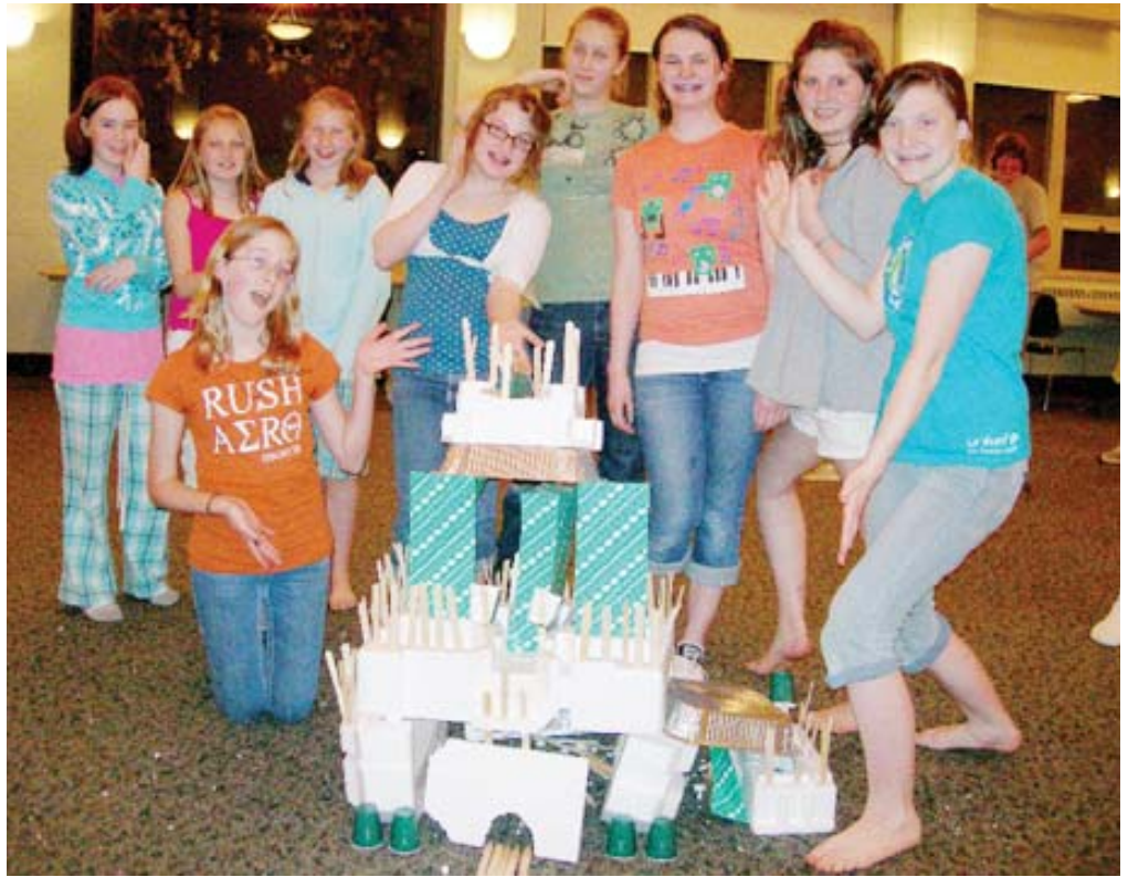
Lock-ins are a big component of faith growth, fellowship and fun in Out of Love Ministries. It is also a way to reach youth who may have never attended our church.